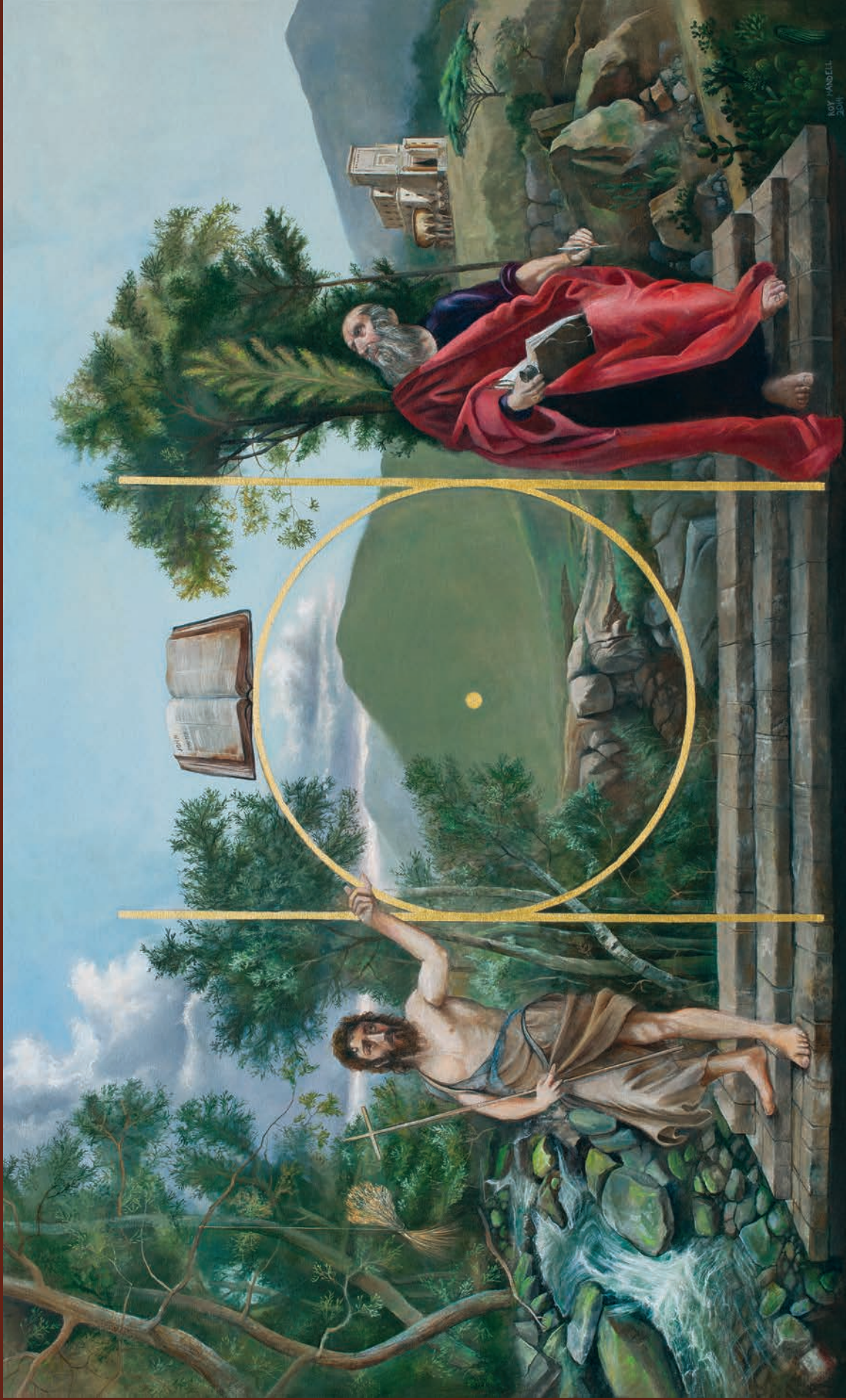
The Patron Saints and the Point within the Circle