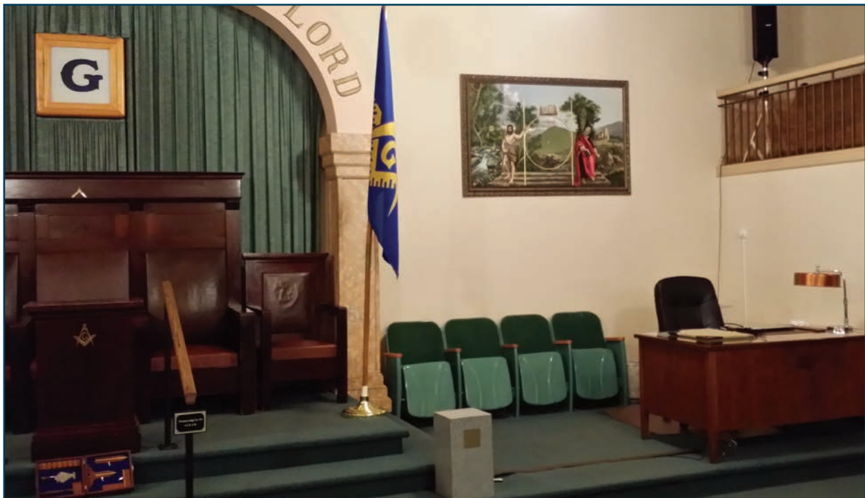
The Patron Saints and the Point within the Circle hanging in the East of John J. Mercer Lodge N o 290 in Omaha, Nebraska.

Another duality connected with the Patron Saints is their solar symbolism, in that the Saints’ feast days are so near the summer and winter solstices. Like most historic commentators on the subject from Preston onward, that leads me to see